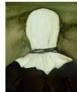
Mink Coat welted around with a Fox Fur , 2008, 110x90 cm