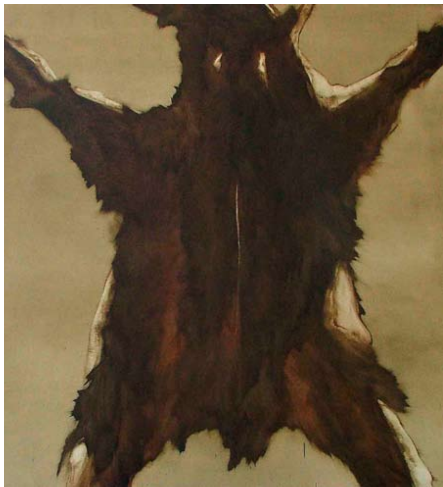
Pelt , 2008, oil on canvas, 120x110 cm