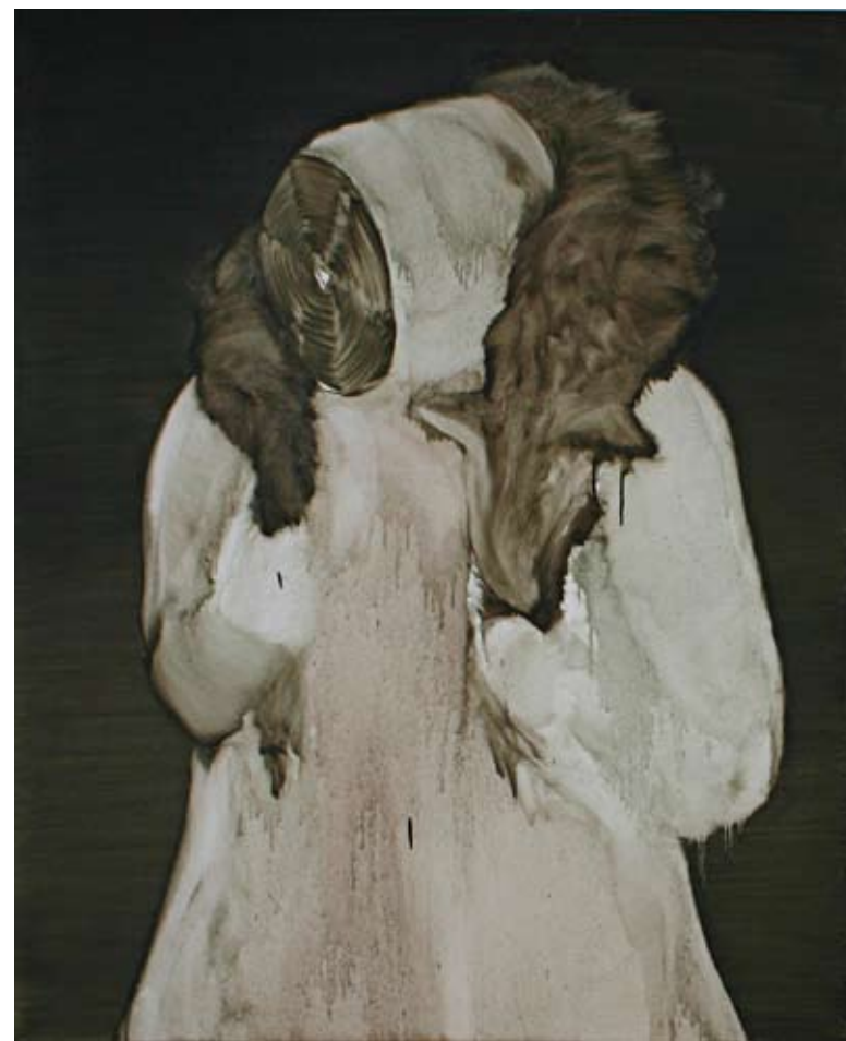
With a Cosset on the Neck , 2008, oil on canvas, 110x90 cm