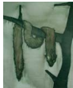
Parasite , 2008, 110x90 cm